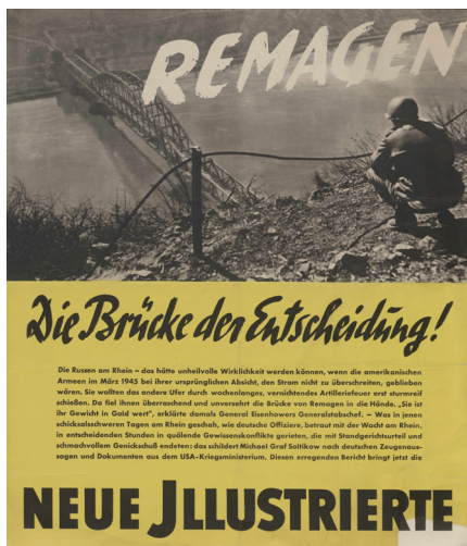
13 „Remagen / The Decisive Bridge!“, Neue Illustrierte, FRG, 1950 / 51

The press images may be used exclusively for current reporting within the framework of the above-mentioned exhibition and only with complete indication of the source.