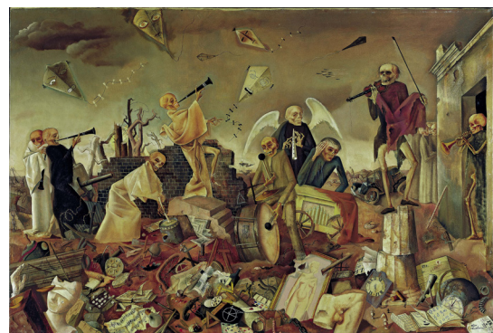
20 „Triumph of Death (The skeletons play for the dance)“, Felix Nussbaum, Brussels, April 1944, oil on canvas