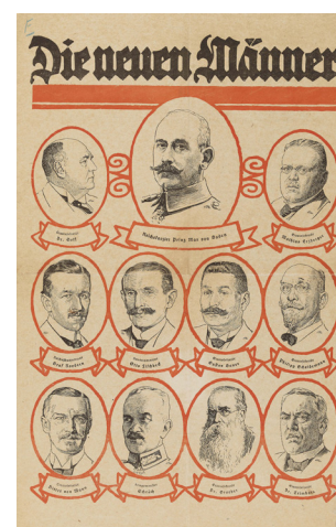
24 „The New Men“, Illustrated special edition with pictures of the members of the cabinet of Prince Max von Baden, Bedazet-Buchverlag, Berlin, 4 October 1918