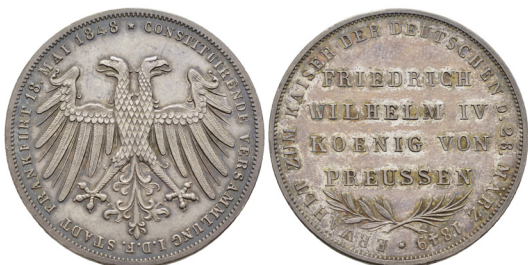
29 Double guilder on the imperial election of King Friedrich Wilhelm IV, Frankfurt am Main, 1849, silver, embossed

The press images may be used exclusively for current reporting within the framework of the above-mentioned exhibition and only with complete indication of the source.