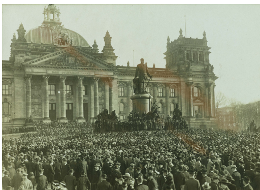
23 Proclamation of the German Republic by Philipp Scheidemann before the Reichstag, Bild- und Filmamt (BuFa), 9 November 1918 © DHM