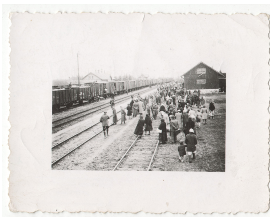
17 Deportation of Jews from the Körmen ghetto (Hungary) to Auschwitz-Birkenau, Körmen (Hungary), 19 June 1944

The press images may be used exclusively for current reporting within the framework of the above-mentioned exhibition and only with complete indication of the source.