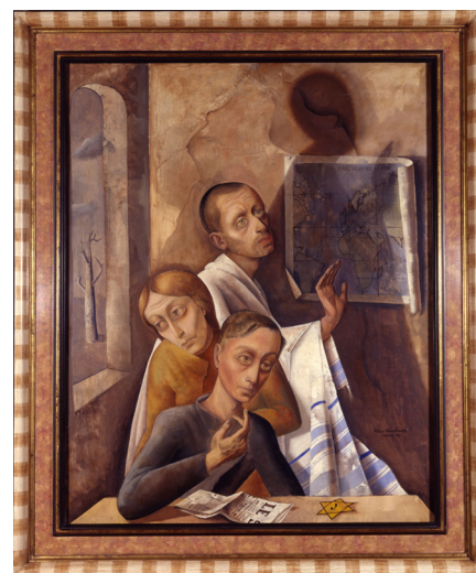
18 „Self-portrait in hiding“, Felix Nussbaum, Brussels, January 1944, oil on canvas