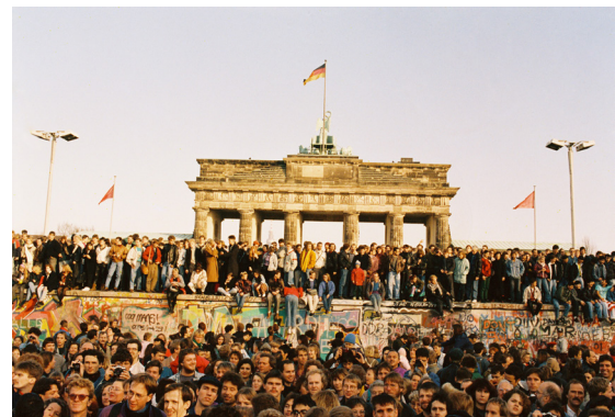
4 People celebrating on the Berlin Wall, Klaus Lehnartz, Berlin, 10 November 1989 © Bundesarchiv/Photo: Klaus Lehnartz