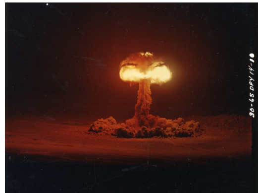
14 Thermonuclear explosion in Nevada at night, USA, 5 July 1957