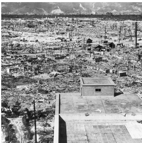
15 View of Hiroshima after the atomic bomb, Japan, 1945 © picture-alliance / akg-images (Free usage period expires on: 1/11/2023)