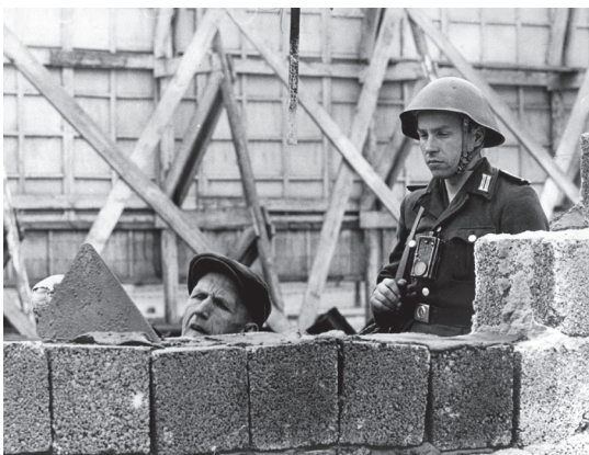
3 Repair of the Berlin Wall in Bernauer Straße, 1962 © picture alliance / ASSOCIATED PRESS (Free usage period expires on: 31/8/2023)