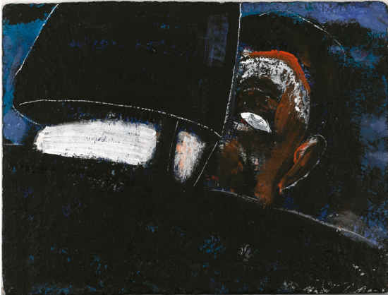
1 „40th Anniversary“, Einar Schleaf, West Berlin, 1989, Mixed media on chipboard, Kulturstiftung Sachsen-Anhalt, Kunstmuseum Moritzburg Halle (Saale) © VG Bild-Kunst, Bonn 2022

The press images may be used exclusively for current reporting within the framework of the above-mentioned exhibition and only with complete indication of the source.