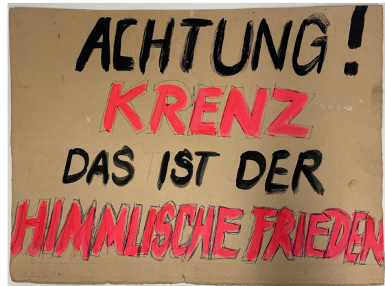
2 Demonstration sign with reference to the massacre on the Square of Heavenly Peace in Beijing, East Berlin, 4 November 1989