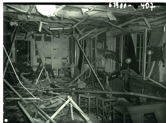
16 Destroyed conference room in the „Führer headquarters Wolfsschanze“, Heinrich Hoffmann, Near Rastenburg / East Prussia, now Kętrzyn (Poland), 20 July 1944 © DHM