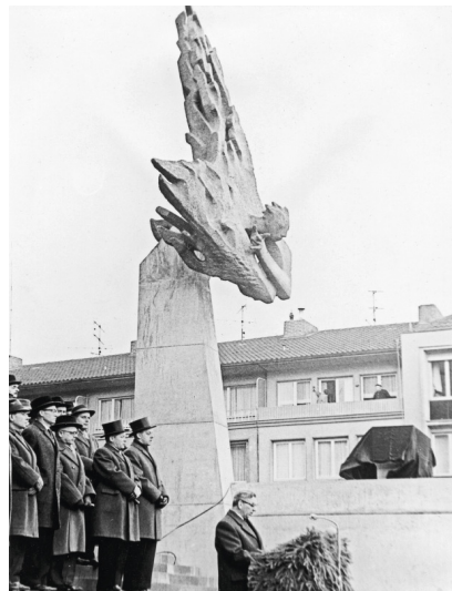
8 Unveiling of the "Flammenengel" (flamed angel) by Adolf Wamper in front of the city hall in Düren 16 November 1962

Download press images: www.dhm.de/presse