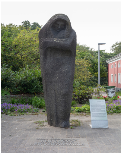
7 Willy Meller, Mourning Woman 1962, in front of the commemoration hall in Oberhausen