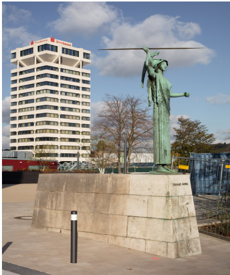
5 Arno Breker, Pallas Athene 1957, Wuppertal © DHM/Photo: Thomas Bruhns, 2020