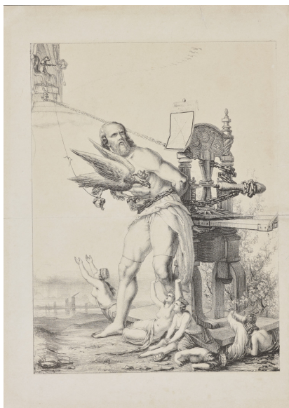
9 Prometheus Bound Lorenz Clasen, 1843