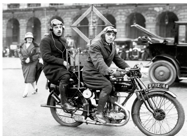
12 Beginnings of radio transmission Listening to radio while motorcycle driving, 1928

Download press images: www.dhm.de/presse