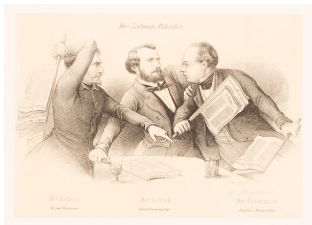
11 The Newspaper Politicians Leipzig, 1849 Lithograph (Reproduction)