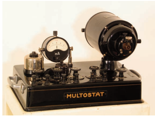
Multostat Germany around 1918 Device for electrotherapy with which "war tremblers" were treated.