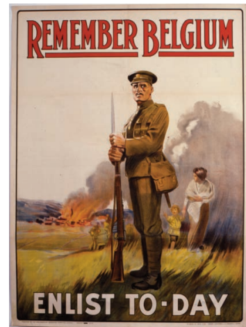
Poster promoting the enlistment of soldiers Great Britain 1914–1916

The picture of atrocities committed by the German army against the Belgian civilian population was supposed to motivate British soldiers to fight against the German Empire.