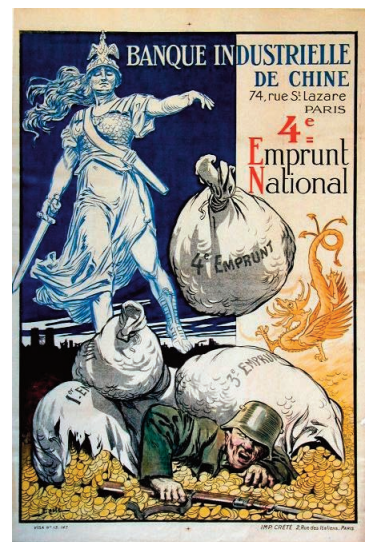
Poster advertising the sale of French war bonds Paris 1918