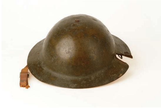
Steel helmet of a British officer, taken as booty by Ernst Jünger Great Britain before 1917