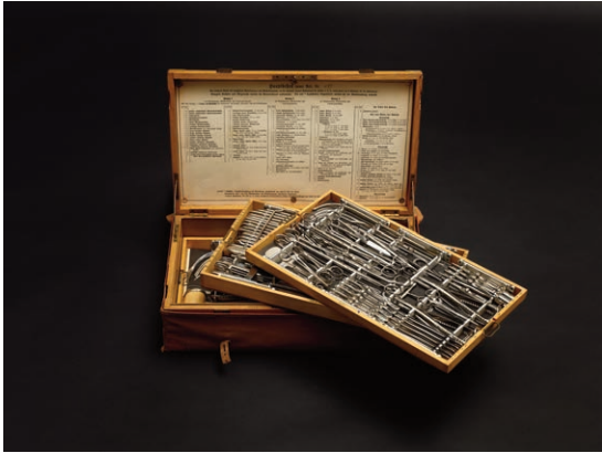
Surgical instruments from a military hospital Germany 1914