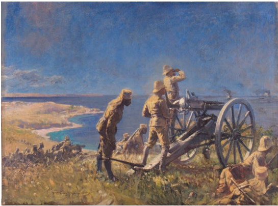
Fighting near Tanga Fritz Grotemeyer, Oil on Canvas, Germany 1918