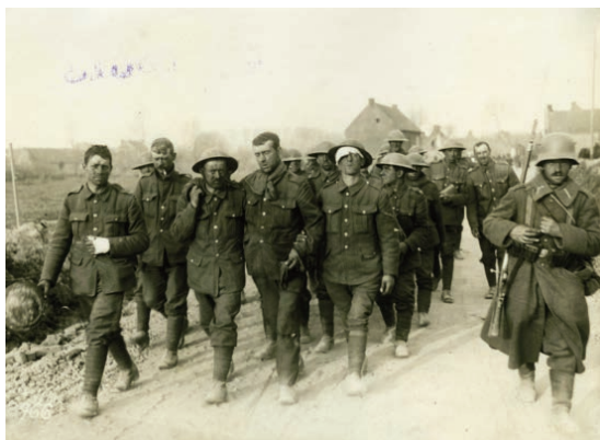
English soldiers as prisoners of war France April 1917