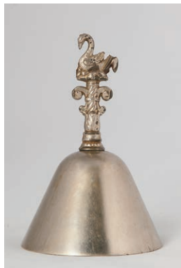
Bell of the chairman of the Sevastopol Workers' and Soldiers' Council

Russia 1917 After the abdication of the Czar, governmental power lay in the hands of the liberal Provisional Government. It had to share power with the socialist Workers' and Soldiers' Councils that grew up throughout the country.