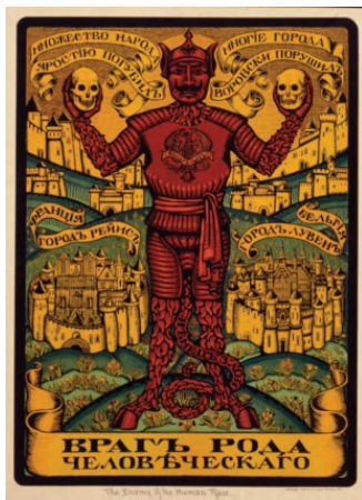
"The Enemy of Mankind" Anti-German poster Russia 1915