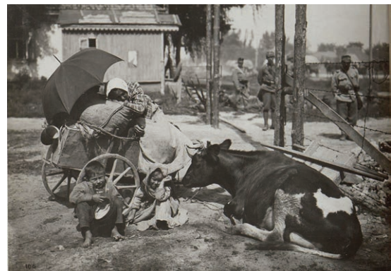
Refugees evacuated from Kovel Ukraine 1916

Download of press photos: www.dhm.de/presse