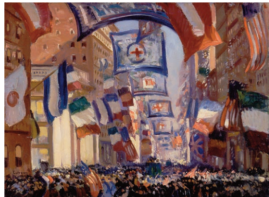
Armistice Day Gifford Beal, USA 1918

Download of press photos: www.dhm.de/presse