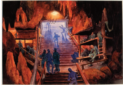
Život u rojnoj pruzi (Life in underground fortifications) Bogumil Car, Aquarelle, At the Isonzo 1917 © Kroatisches Historisches Museum, Photo: Ivana Asić Italian and Austro-Hungarian troops had been fighting each other at the Isonzo and in the Alps since 1915. There, with great effort, the soldiers dug into the mountains to make underground fortifications.