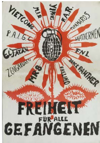
Holger Meins, Poster for May Day 1970, Berlin © Hamburger Institut für Sozialforschung