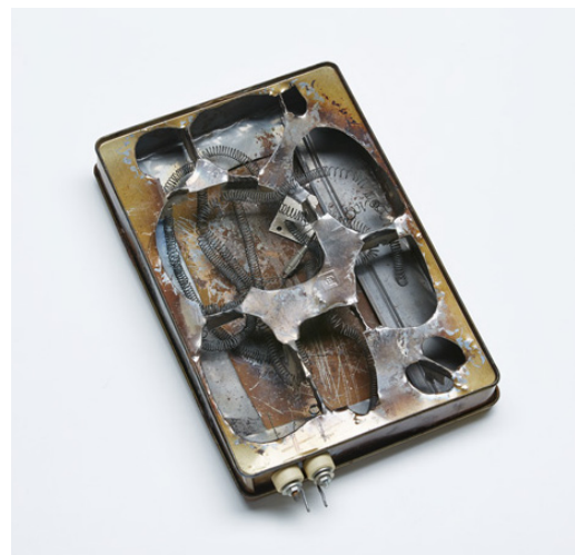
Pizza oven of Jan-Carl Raspe, made out of a rectangular biscuit tin, from around 1975/76, found in Stammheim Prison