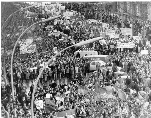
Demonstration on Kurfürstendamm on the occasion of the International Vietnam Congress, 18 Feb. 1968