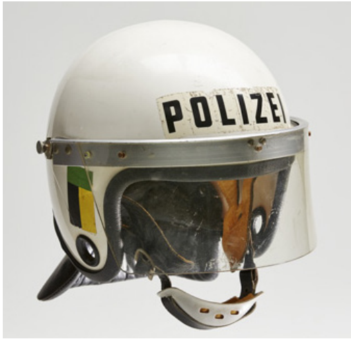
Helmet of the Special Task Force Baden-Württemberg from Göppingen, 1977

The state responded to the terrorist challenge in part by establishing new police units. For difficult deployments there were four Mobile Task Forces (MEK) in southwest Germany from 1972 on, with a total of 100 officers. The Special Task Force (SEK), founded in 1977, was formed to serve in the fight against terrorism, but it was also used to control demonstrators. A unit much better known to the general public was the anti-terror force GSG 9 of the Federal Border Guard, which freed the hostages in Mogadishu on 17 October 1977 from the Palestinian hijackers of the Lufthansa machine "Landshut".