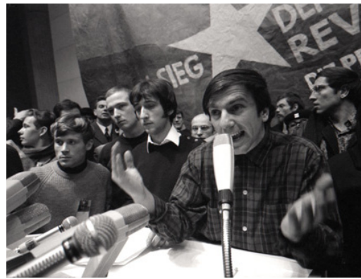
Rudi Dutschke speaks at the International Vietnam Congress in Berlin, 17/18 Feb. 1968