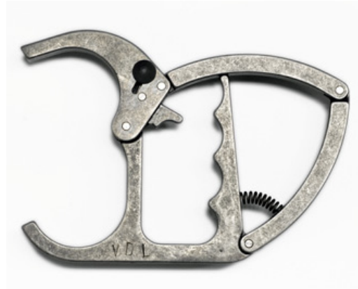
Shackle for leading prisoners to the courtroom, Stammheim Prison, 1975