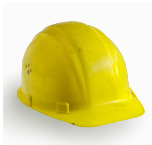
Hard hat for protection against police truncheons, around 1968