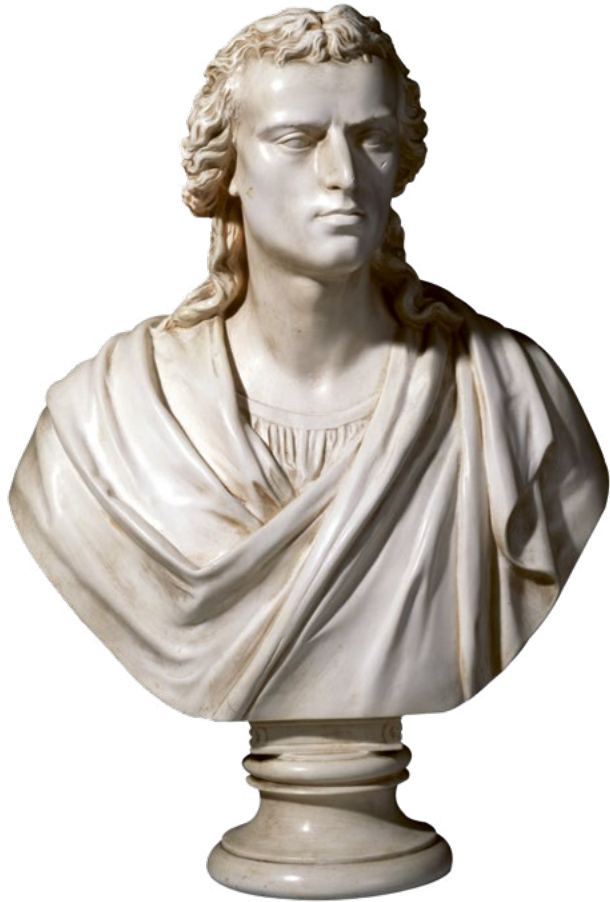
Friedrich von Schiller, Origin 1809/1810, Reshape 1994

As a poet, historian and critic, Schiller (1759–1805) was active in Stuttgart, Dresden and Jena before going to Weimar in 1799. Together with Goethe he created the "German classic". In 1802 he was ennobled.