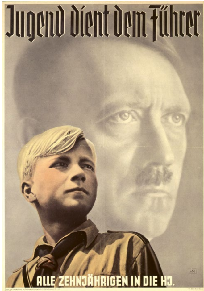
"Youth serves the Führer: every 10 year-old into the Hitler Youth", ca. 1939 Years of training in the Hitler Youth were to transform its members into fervent admirers of Hitler and staunch National Socialists.

Postage 6 €(Germany), 9 €(international)