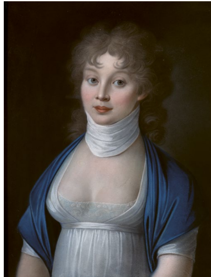
Queen Louise of Prussia, 1799 Louise of Mecklenburg-Strelitz (1776–1810) was married to King Frederick Wilhelm III. of Prussia. They had nine children. Her personal resistance to the strict conditions of peace dictated against Prussia by France in 1807 and her early death in 1810 made Queen Louise a popular symbolic figure.

7000 historical exhibits show us how people lived and thought, as well as the events and historical developments they were part of. The exhibition focusses on political history shaped by rulers, politicians and communities. Furthermore, each epoch in the exhibition also contains a variety of rooms in which everyday life is explored.