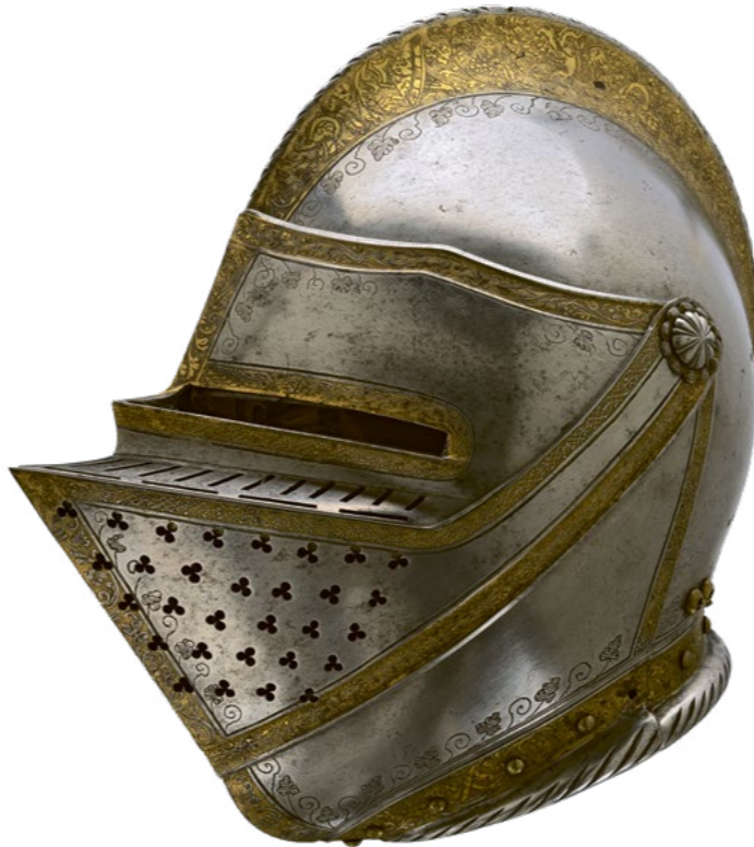
Closed helmet for King Francis I of France, 1539/1540 The helmet belongs to a set of armour that included jousting armour and "modest fluted armour for the field". The set was ordered by Archduke Ferdinand I in 1539 as a gift for the French king.

© fuehrung@dhm.de ☎ +49 30 20304-750 / -751 🌐 www.dhm.de/bildung-vermittlung