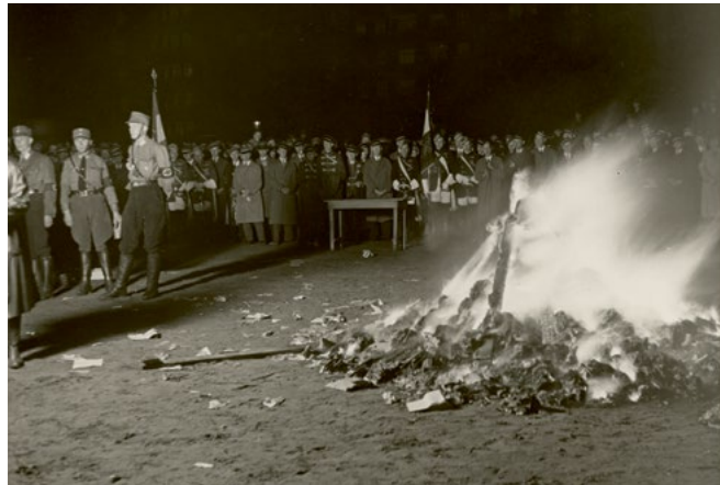
Book burning in Hamburg, 15 May 1933 The German Student Union and the National Socialist German Students' League organised public book burnings in Hamburg on 15 and 30 May 1933. The books targeted for burning were those viewed as being subversive or as representing ideologies opposed to Nazism.

As a poet, historian and critic, Schiller (1759–1805) was active in Stuttgart, Dresden and Jena before going to Weimar in 1799. Together with Goethe he created the "German classic". In 1802 he was ennobled.