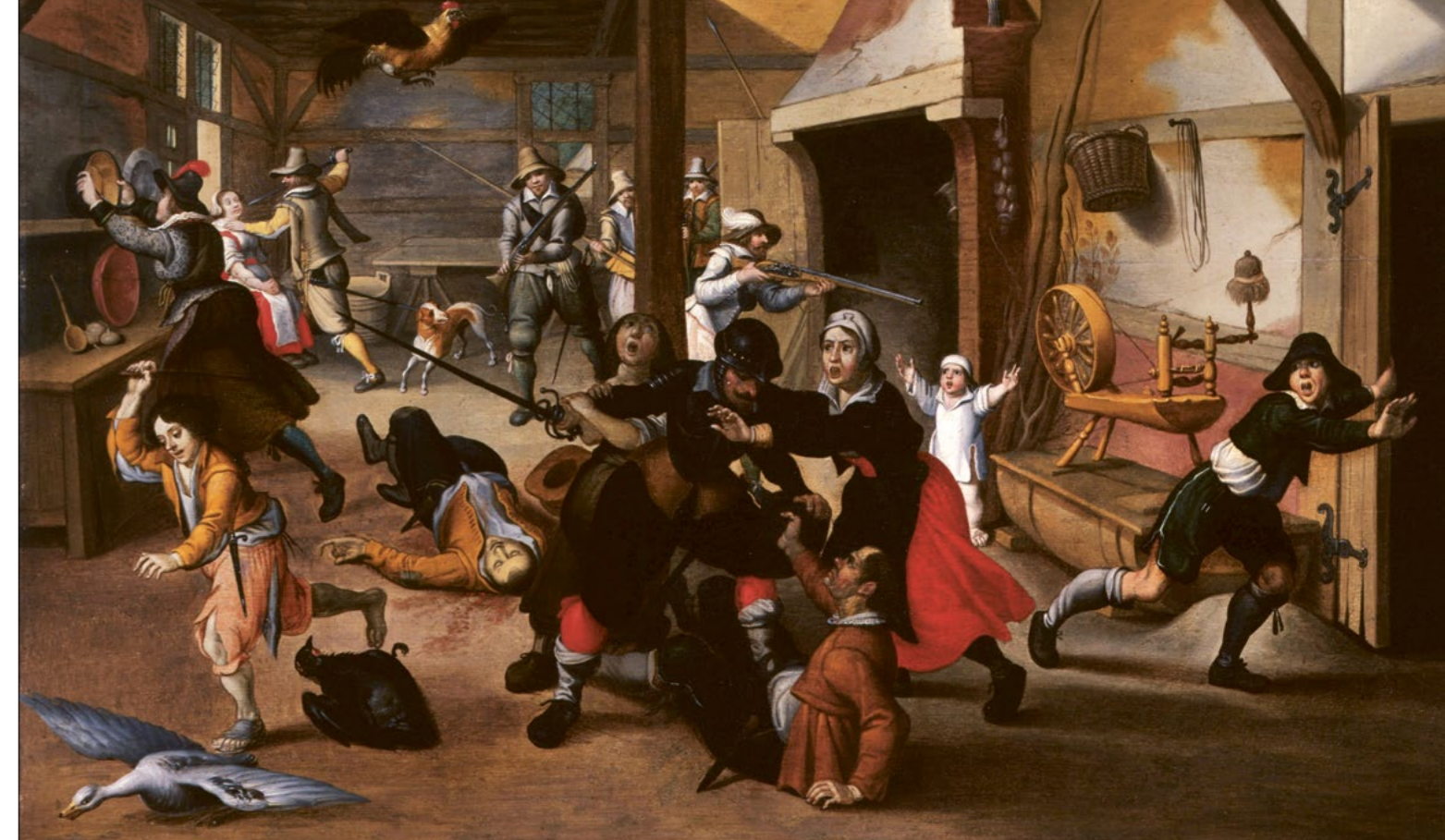
Soldiers plundering a farm, ca. 1620 Plundering was an everyday occurrence in war. The soldier was seen as the mortal enemy of the peasant. The high level of detail evident in this painting makes it an unsettling, oppressive document on how war affected the local population.