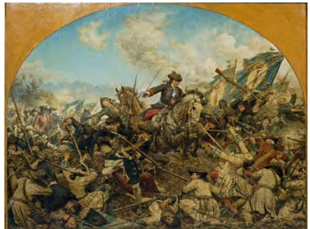
2 Hermann Joseph Wilhelm Knackfuß: Prince Leopold of Anhalt-Dessau at the Battle of Turin on 7 September 1706, 1884, Oil on canvas