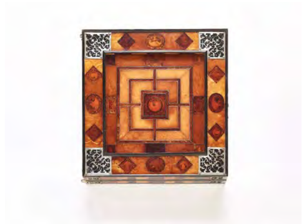
14 Board game box for nine men's morris, chess, and tric trac, formerly in possession of Anne of Denmark, dated "5. Aprilis 1607", amber, ivory, metal foil, ebony, silver