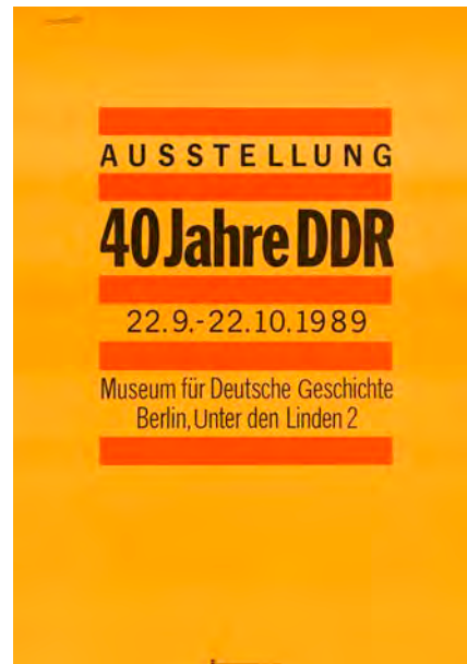
8 Exhibition poster "40 Years GDR", Printer: Neues Deutschland, East Berlin 1989

Download press images: www.dhm.de/en/press