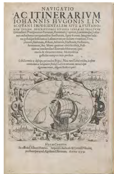
16 Title page of the travelogue of the Dutch seafarer Jan Huygen van Linschoten's voyage to India, First edition in Latin (Itinerario), The Hague, 1599

Download press images: www.dhm.de/en/press