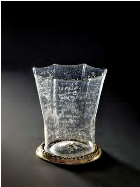
13 Welcome beaker of the Oettingen counts, the so-called Oettingen Welcome, Southern Germany, engravings 1548–1650, Glass, colourless, engraved; silver, gold-plated and engraved

An exhibition of the Deutsches Historisches Museum 8 May 2026 to 31 October 2027