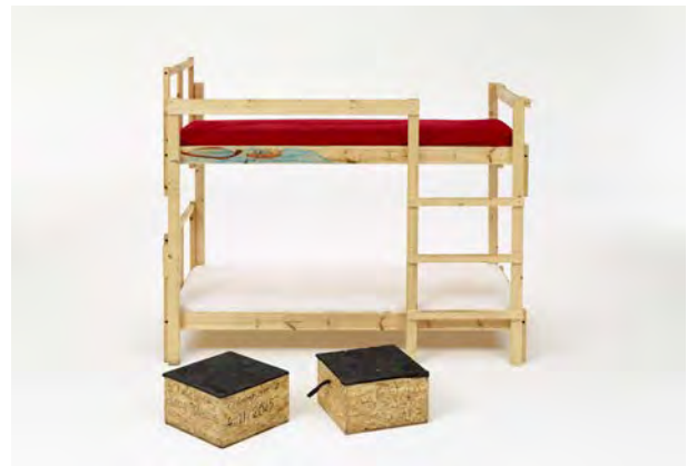
22 Bunk bed for refugees and two privacy boxes, Two wooden Ikea beds, model Fjellse, Kassel, 2015, Pine-wood, inscribed, painted

Download press images: www.dhm.de/en/press