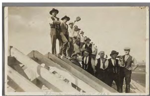
20 Journeymen of the Association of Upright Foreign and Domestic Journeymen Carpenters and Slaters and construction workers on the roof truss of a building, dated "October 1926", gelatin silver print

Download press images: www.dhm.de/en/press