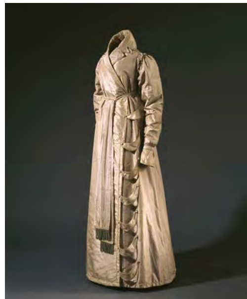
4 Dressing gown of Queen Luise of Prussia, Germany or France, 1806–1810, Silk, taffeta, trimmings, metal, wool