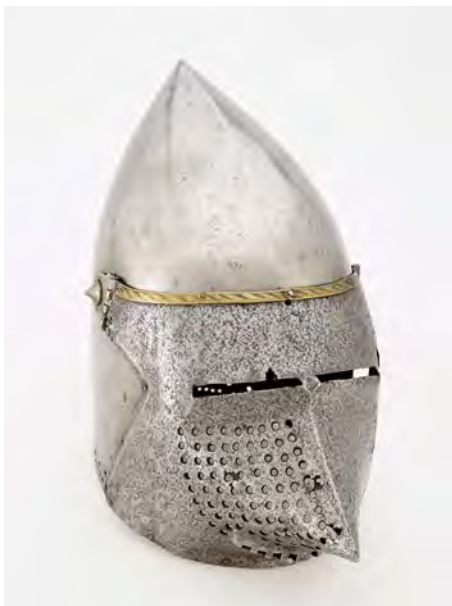
3 Hounskull, Northern Italy, ca. 1360, Iron, brass