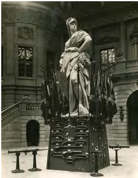
1 Exhibition of new acquisitions from 1910/11 in the Zeughaus on the occasion of Kaiser Wilhelm II's birthday, August Scherl Illustrations-Centrale G.m.b.H., Berlin, 1912 © Deutsches Historisches Museum

An exhibition of the Deutsches Historisches Museum 8 May 2026 to 31 October 2027