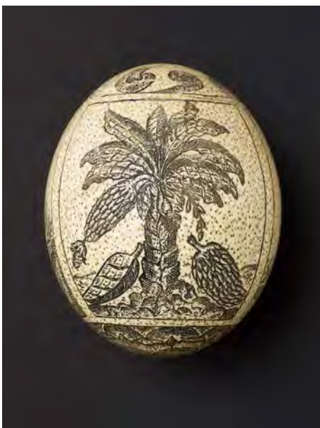
15 Engraved ostrich egg with motifs from Jan Huygen van Linschoten's Itinerario, Netherlands, ca. 1600/1620, Ostrich egg, notched, engraved, blackened