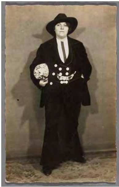
21 Woman dressed in a journeyman's uniform with a travel bundle, Cologne, dated "Carnival 1929", silver gelatine print

An exhibition of the Deutsches Historisches Museum 8 May 2026 to 31 October 2027