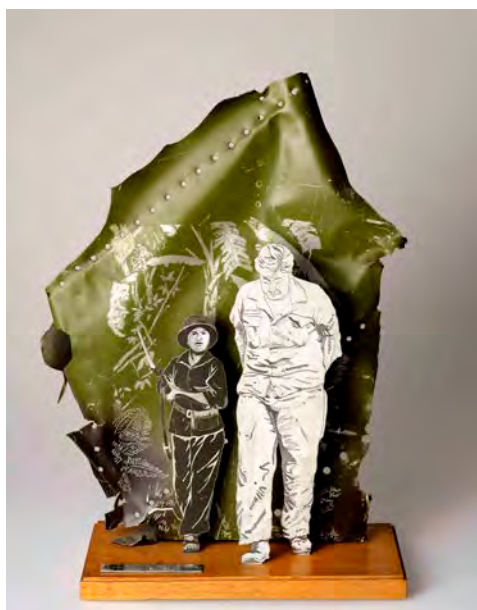
9 Table decoration with part of an American airplane wreck based on a photo from the Vietnam War, Vietnam, 1967–1975, Wood, aluminium, engraved

An exhibition of the Deutsches Historisches Museum 8 May 2026 to 31 October 2027