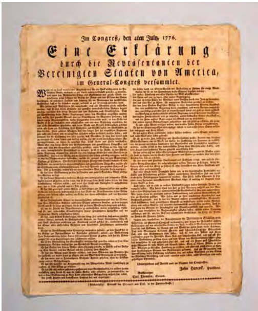
5 First printing of the Declaration of Independence of the United States of America in German, Authors: Thomas Jefferson et al., Translator: Charles Cist, Philadelphia, 6.–8.7.1776, Paper © Deutsches Historisches Museum

An exhibition of the Deutsches Historisches Museum 8 May 2026 to 31 October 2027