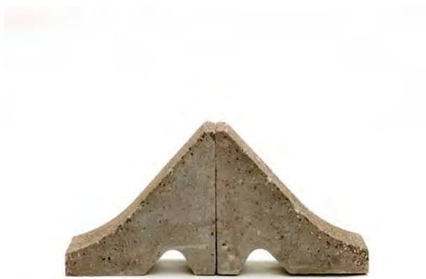
19 Two former boundary stones of the border, Neustraße/Nieuwstraat, Herzogenrath (D)/Kerkrade (NL), 1968/1993, Precast concrete