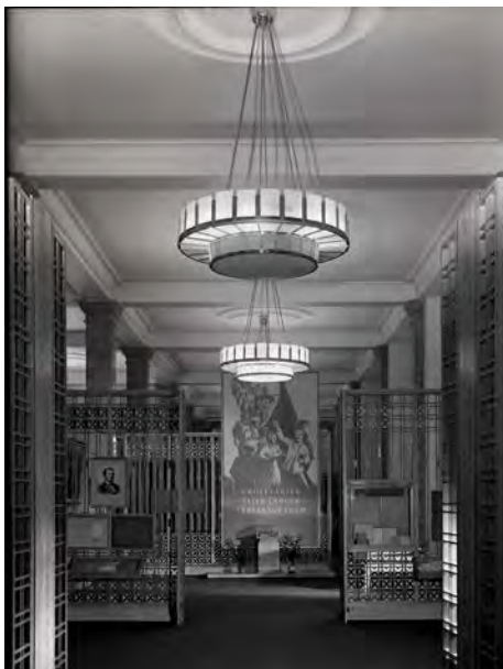
7 The Communist Manifesto in the first special exhibition "Karl Marx" at the Museum für Deutsche Geschichte, East Berlin, 1955