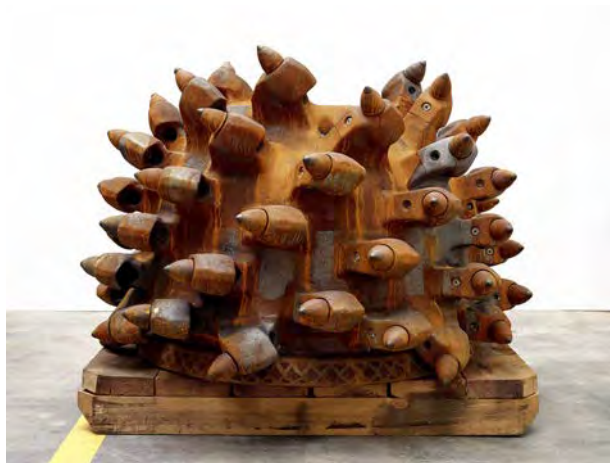
17 Transverse cutting head (shearer head) for a roadheader, Voestalpine AG, Austria, 2003/2016, Steel, cast and bolted

An exhibition of the Deutsches Historisches Museum 8 May 2026 to 31 October 2027