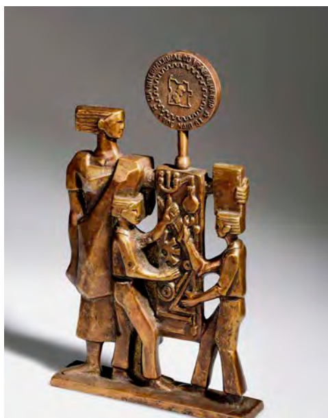
10 Table decoration for International Labour Day on 1 May, Portugal, Mai 1981, Brass, cast, embossed