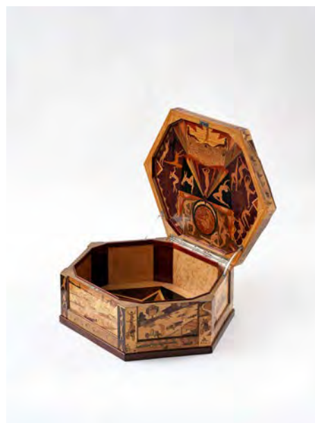
18 Hexagonal chest with a model of the German Stadium, Berlin-Charlottenburg, Gustav Baumann, Berlin/Potsdam, 1912 (model), 1923/24 (chest), Marquetry hardwoods